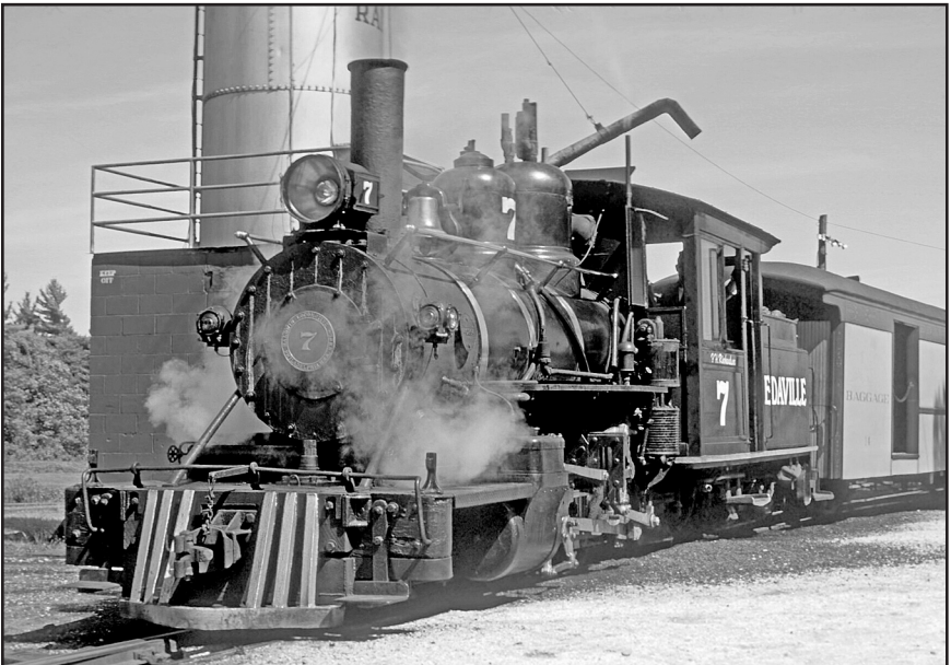
Edaville Railroad at South Carver, Maine in 1976.

For Rail Report 677, the masthead photo features CB&Q 677 at Galesburg, Illinois in 1905.