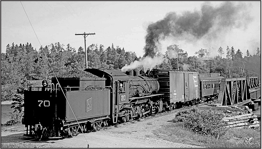
Sydney & Louisburg Railroad, Nova Scotia in 1960.