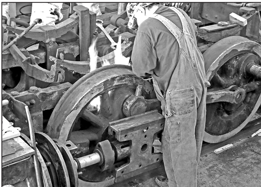
John Braun torching off the pin head to remove the drive rod.