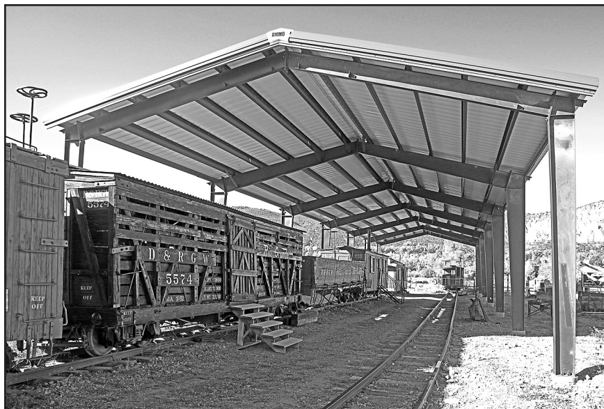
The new Ridgway Railroad Museum open-sided train shed.